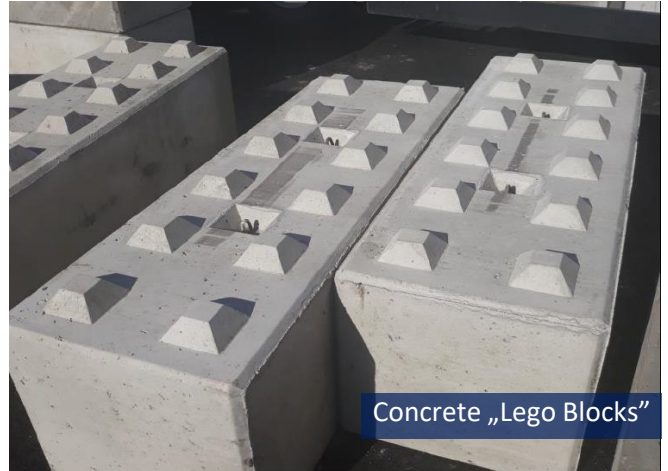
Concrete „Lego Blocks”