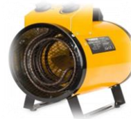
HEAT & COOLING SYSTEMS