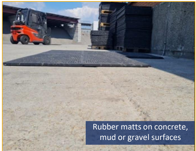
Rubber mats on concrete, mud or gravel surfaces