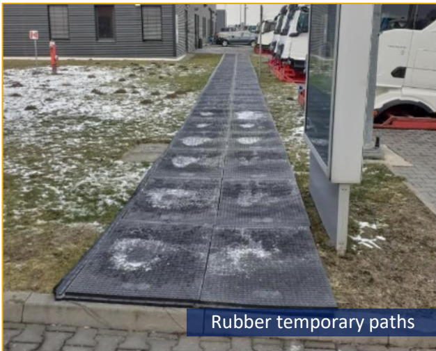
Rubber temporary paths