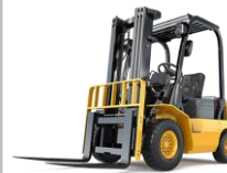
MATERIAL HANDLING EQUIPMENT