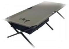
SLEEPING COTS & BEDS