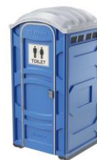
SANITARY TOILETS & SHOWERS