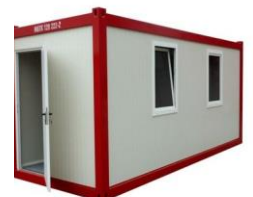
CONTAINERS (Sanitary, Shower, living, Office)